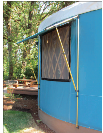
Completed Window Awning Frame