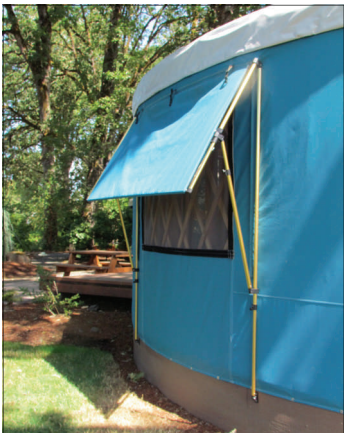
Extended Window Awning Frame